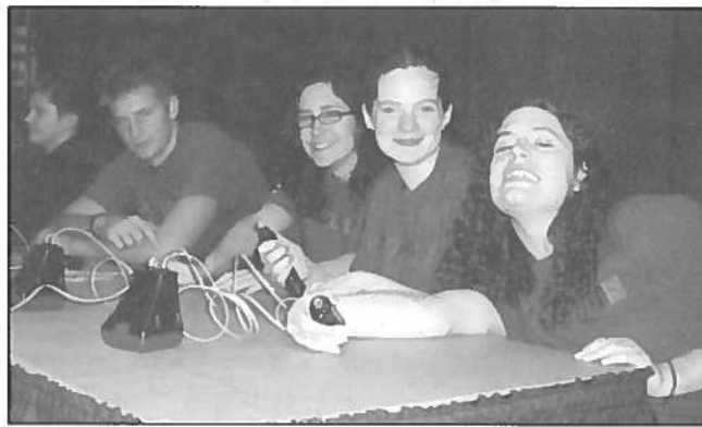
Team Fairfield Warde sported matching tee shirts at this year's quiz bowl