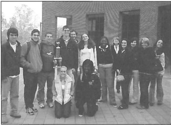
Windsor High School students proudly stand with their first place trophy. Congrats Windsor!

Windsor High School left the UConn Storrs Campus on November 8th as the proud winners of this year's UConn ECE French Quiz Bowl. Approximately 130 students from Coventry High School, E.O Smith High School, Enrico Fermi High School, Fairfield Warde High School, Glastonbury High School, Southington High School and Windsor High School enjoyed a full day of French activities. Shelton High School, new to UConn ECE, joined in the festivities as the eighth participating school at the quiz bowl.