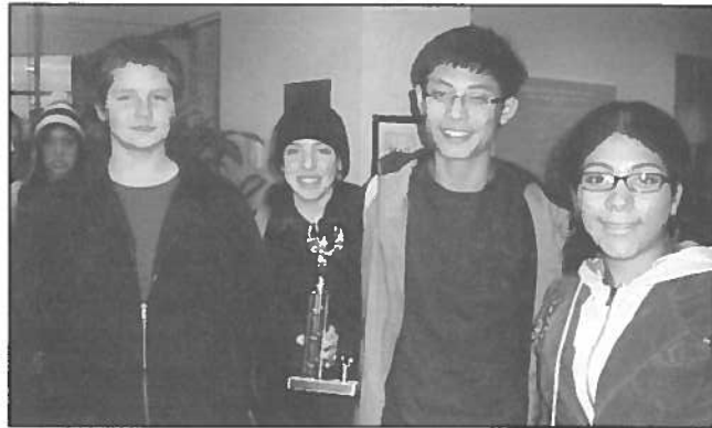
Glastonbury High School's team took home their third place trophy