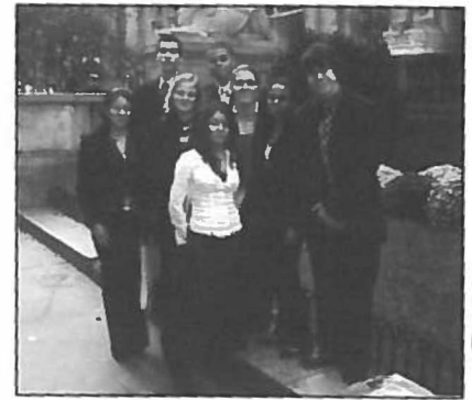
UConn ECE students at Bulkeley High School stand in front of the New York Public Library.

more informal setting. The representatives of the kingdom stressed that it has a strong orientation for peace, defense against terrorism, and using oil wealth to promote a high standard of living for all citizens.