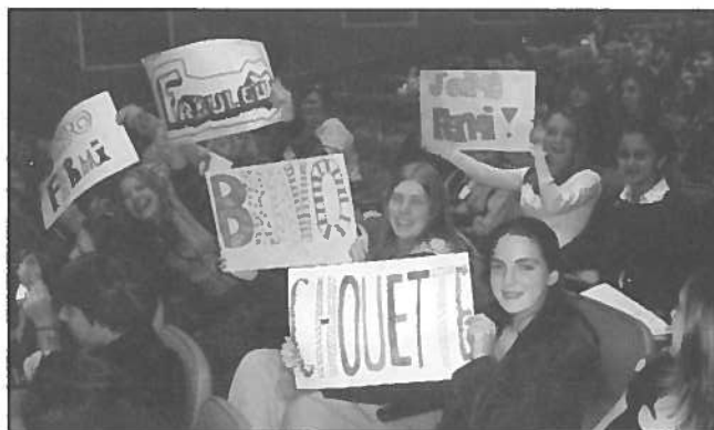
Students in the audience cheer on their schools' teams