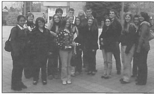
Enrico Fermi students show off their second place trophy