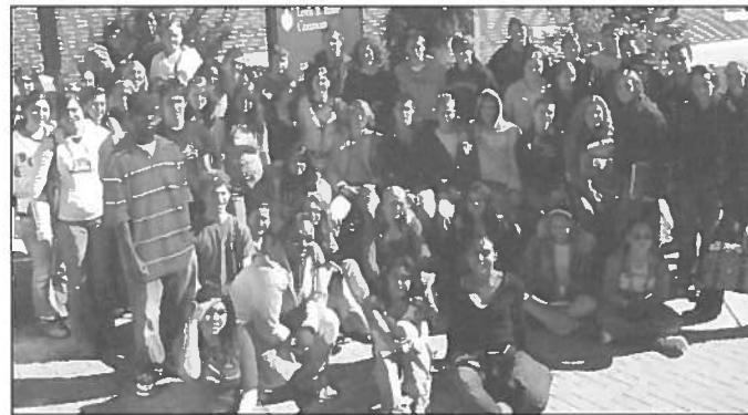
UConn ECE students taking American Studies at Manchester High School visited the UConn Storrs campus on October 16th. Students toured campus, ate lunch at a campus dining hall and visited the Homer Babbidge Library.